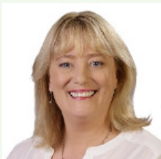
The Hon Ros Spence MP